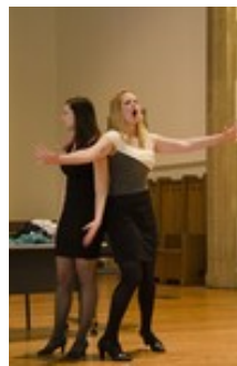
Students participating in CARS 2012

Finally, in order to further strengthen and support student creative activity, research, and scholarship, there will be a departmental funding initiative again this year. Details will follow.