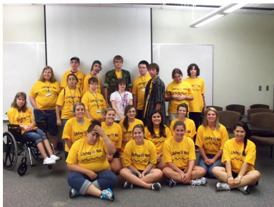
Some of the students and mentors in LifePrep@Naz Program