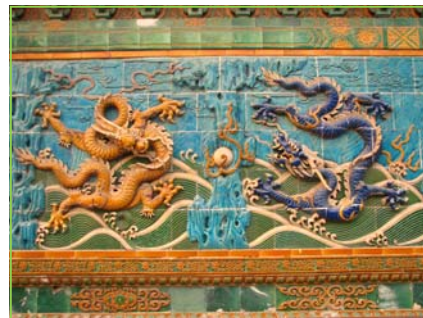
These dragons are on the Nine Dragon Wall, built in Beihai Park, Beijing about 600 years ago.

This is a dragon curve, a fractal where each stage is made by taking a copy of the curve and adding a second copy perpendicular to the first. This diagram below shows the first five iterations and the ninth.