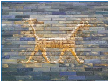
This dragon is on the Grand Gate of Ishtar, built in Babylon (present day Iraq) about 2500 years ago.

Do not meddle in the affairs of dragons for you are crunchy and taste good with ketchup.