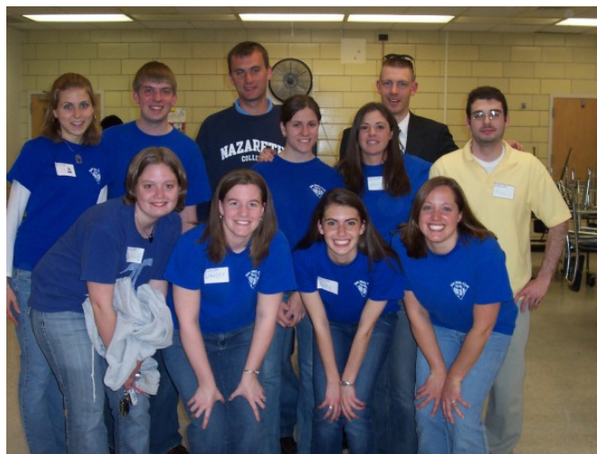
Math Night 2005 at Martha Brown Middle School in Fairport, NY, the first picture to appear in Our Newsletter