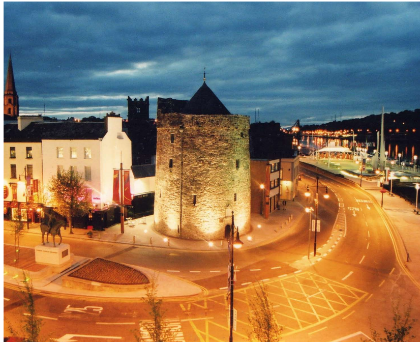
Studying in Waterford