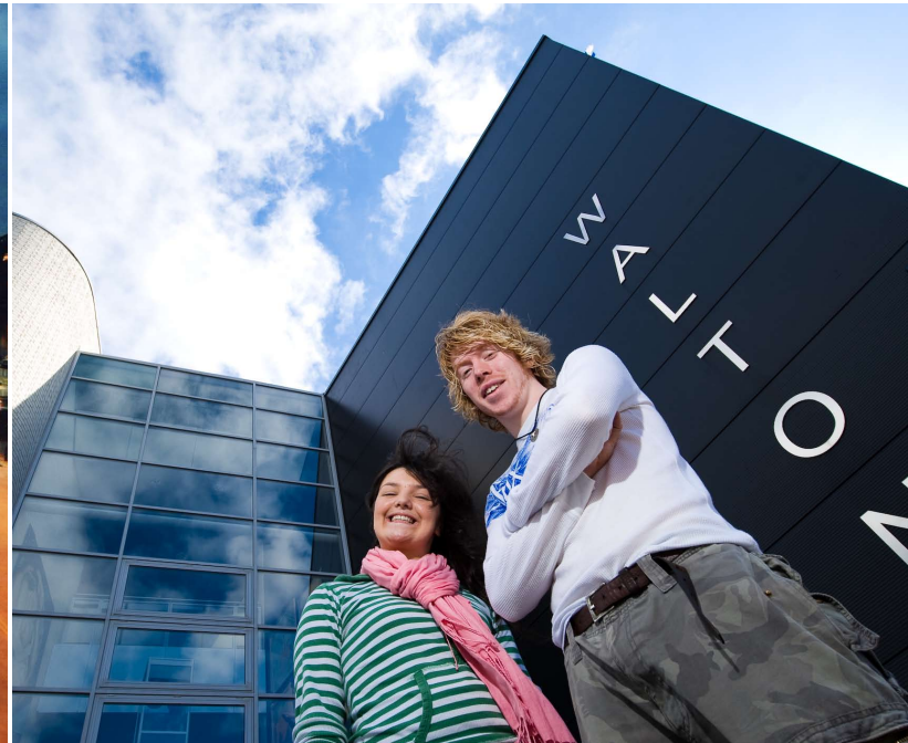
Types of Programmes Available