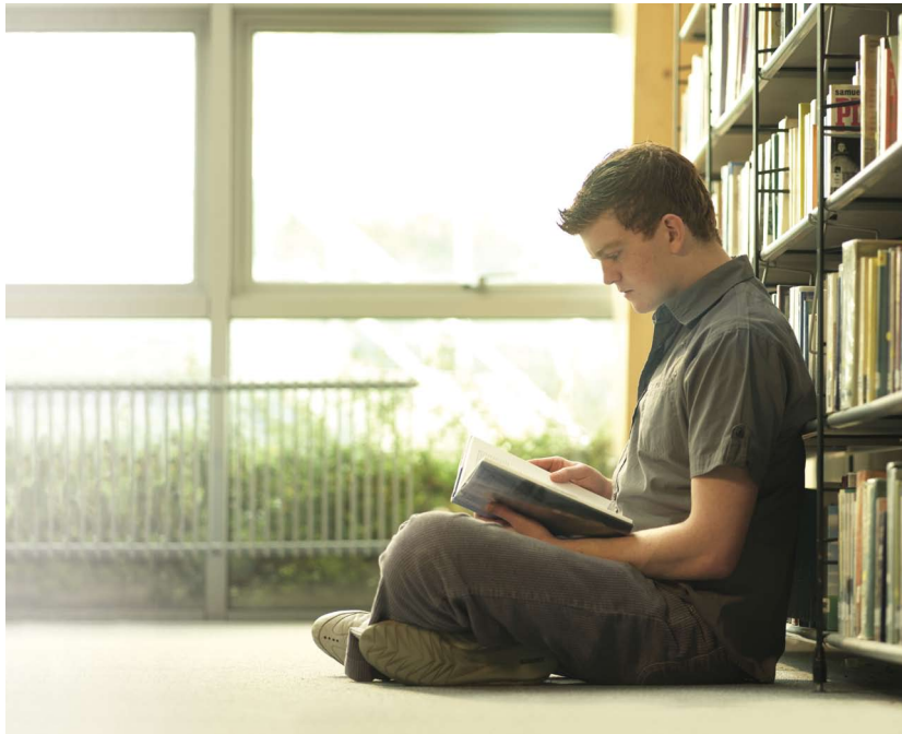
Science and Computing